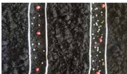
7.5" row spacing