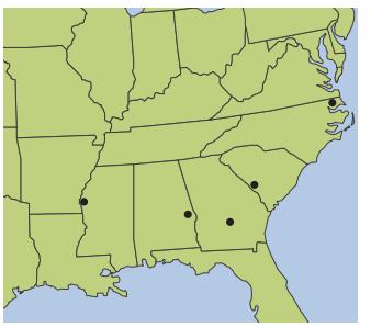
LOCATIONS: 5 trials across regions of the U.S. (AL, GA, MS, NC, SC)