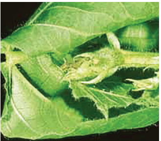
FIGURE A: Boron deficiency in cotton