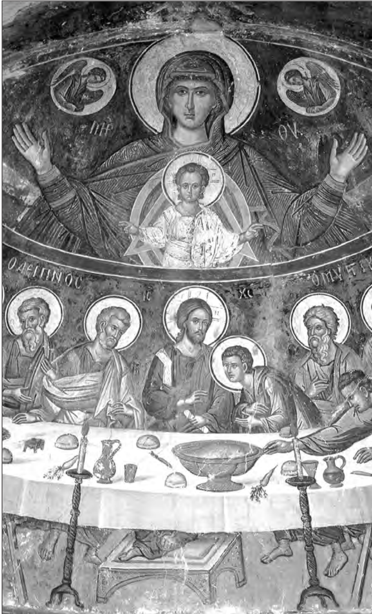
Detail of the Mystical Supper, Katholicon, Holy Monastery of Stavronikita, Mount Athos.