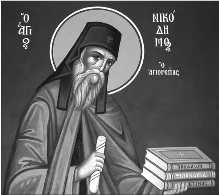
Saint Nikodemos the Hagiorite, Katholikon, Annunciation Monastery, Patmos.