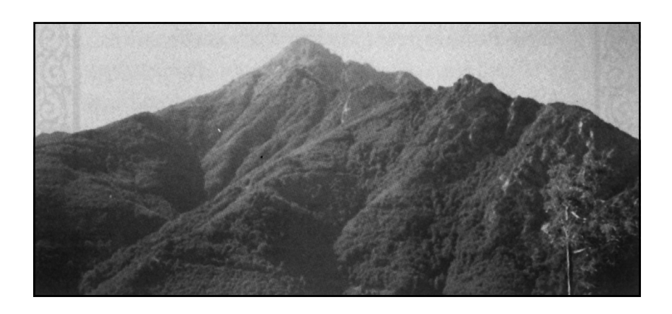
View of Athos from Lakkoskiti