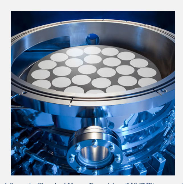
Figure 2: Metal Organic Chemical Vapor Deposition (MOCVD) reactor (Credit: Veeco).