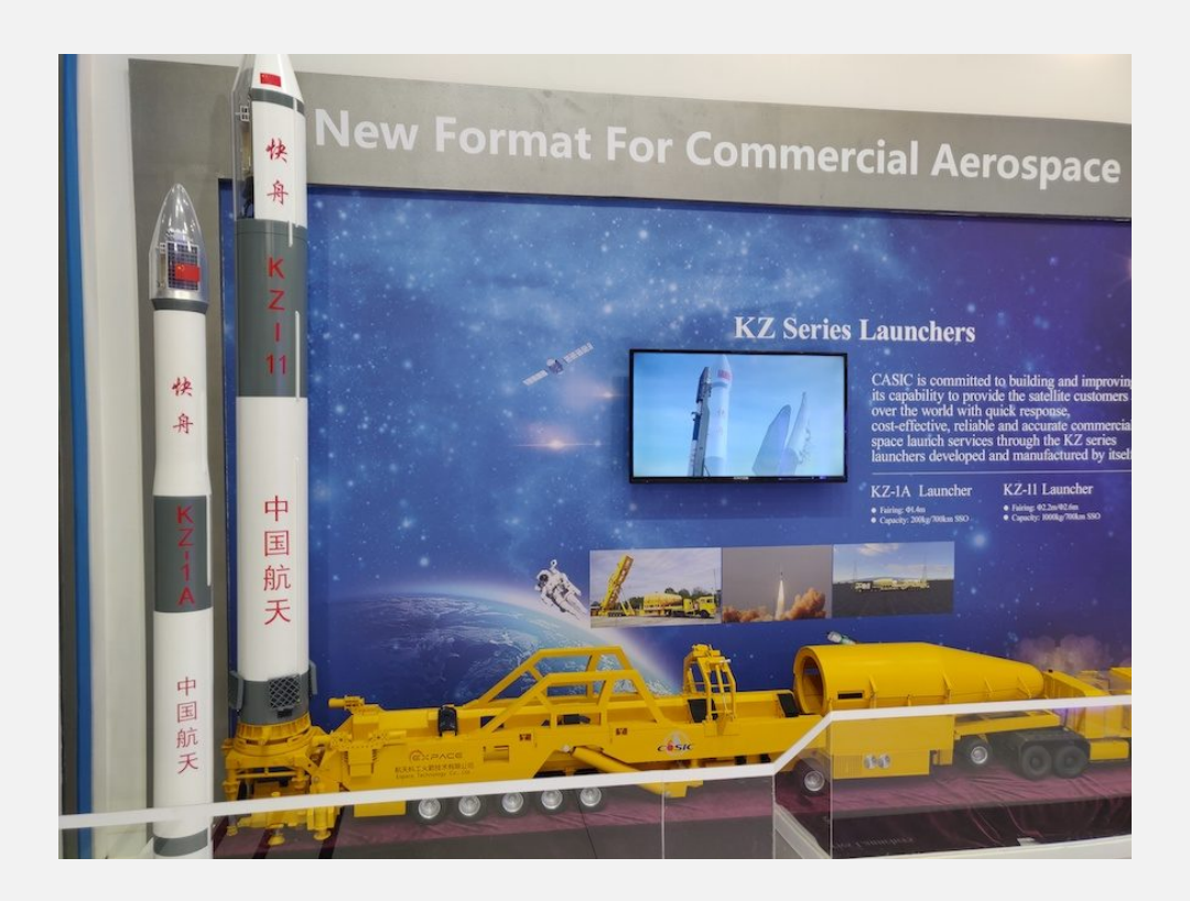
Figure 3: Kuaizhou-1A and 11 launch vehicle models on display.