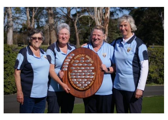
Elderslie Golf Club

Elderslie secured its third victory in the Barclay Shield conducted at the Devonport, Riverside and Royal Hobart Golf Clubs in September.