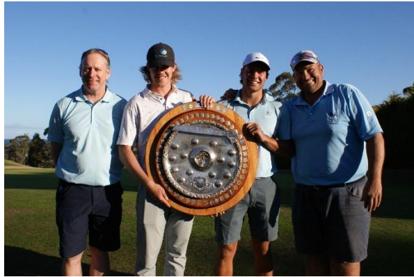
Tasmania Golf Club

The tournament was keenly contested with Kingston Beach and Launceston tied for the lead following Saturday afternoon's foursomes round.