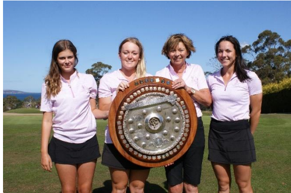
Launceston Golf Club

The Launceston ladies led Royal Hobart Golf Club by four strokes overnight following the foursomes round on Saturday afternoon.