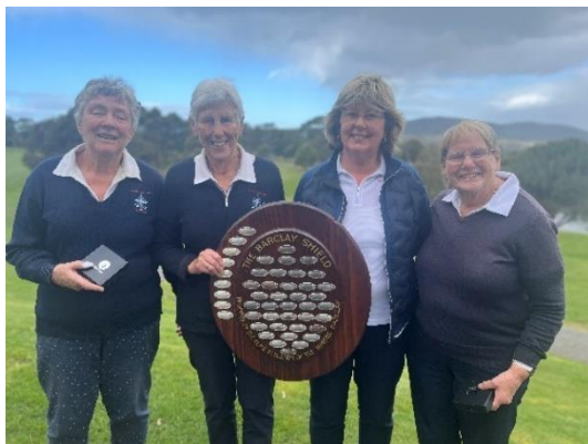
North West Bay Golf Club

North West Bay Golf Club secured its fourth victory in the Golf Australia's Barclay Shield for women conducted on home soil.