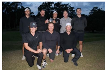
Golf Southern Tasmania

Golf Southern Tasmania had a successful weekend in April winning a fiercely contested men's Thyne Trophy at the Ulverstone Golf Club.