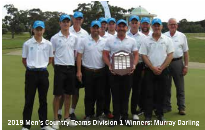
2019 Men's Country Teams Division 1 Winners: Murray Darling