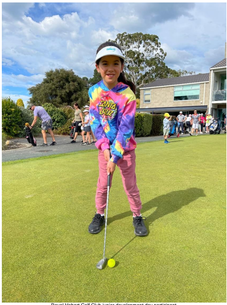
Royal Hobart Golf Club junior development day participant.

Damon is based on the North/West Coast but services clubs across the state.