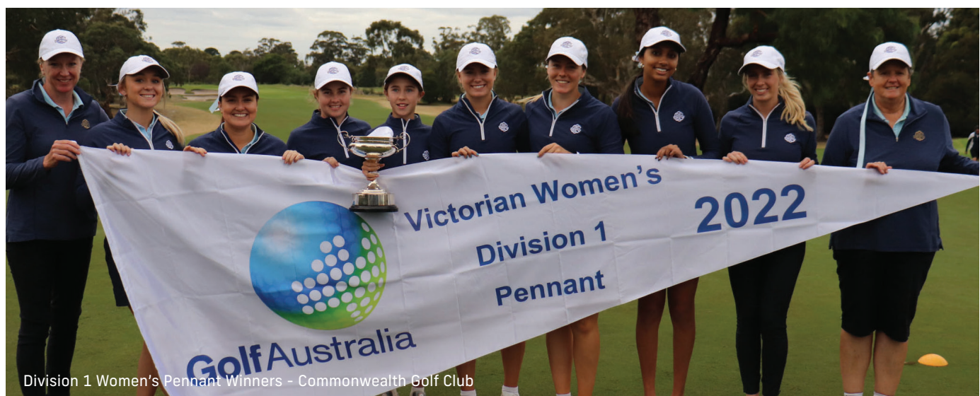
Division 1 Women's Pennant Winners - Commonwealth Golf Club