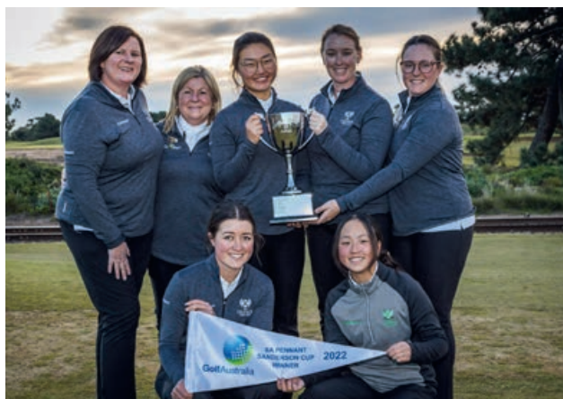
Sanderson Cup Winners - The Grange Golf Club