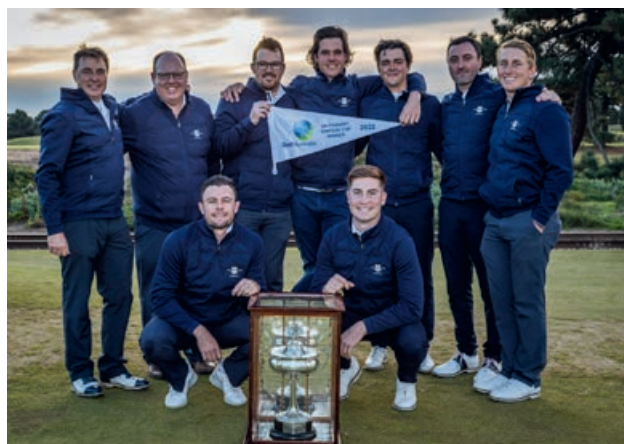
Simpson Cup Winners - Kooyonga Golf Club