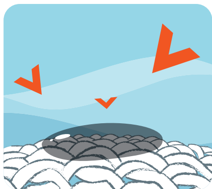
Its multi-enzyme system breaks different kinds of stains into smaller pieces.

Fairy Non-Bio Professional Powder technologies act in synergy to ensure the removal of the tough stains professionals face on a daily basis.