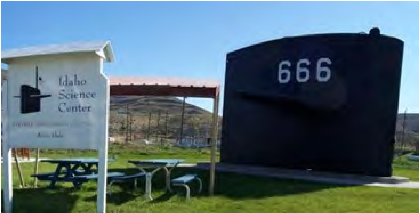
Sail of USS Hawkbill (SSN-666) in Arco, Idaho

Or, she may become a museum piece. Some submarines like the USS Bowfin (SS-287) in Pearl Harbor and the USS Nautilus (SSN-571) in Groton are intact and open to the public, while others like the USS Hawkbill (SSN-666) in Arco, Idaho have only their sails on display.