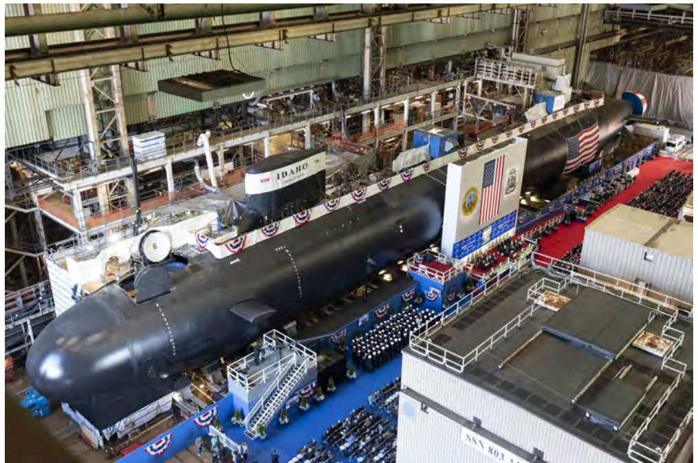
The future USS IDAHO.

In closing, it has been over a century since the Battleship USS Idaho (BB-42) — a ship made famous by her service in World War II — was christened. I think that I speak for all of us here today when I say that it's high time we give special honor to the state of Idaho — so rich in its Naval history — and christen again another USS IDAHO.