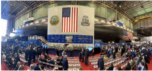
USS IDAHO Christening, at the General Dynamics Electric Boat Shipyard, on Saturday, March 16, 2024.

A patriotic crowd of approximately 4,000 national, state, and Navy leadership, Idahoans, crew members, submarine veterans, Electric Boat employees, and members of the public gathered at the Electric Boat shipyard in New London, Connecticut to christen the future USS IDAHO.