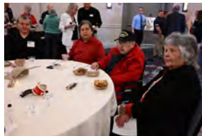
Representatives of the Nez Perce Tribe enjoy dinner.