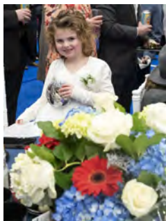
USS IDAHO flower girl.