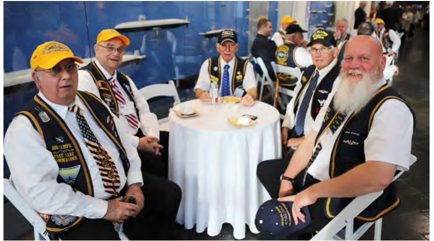
Group of U.S. Navy Veteran Submariners, lovingly referred to as "Old Salts," enjoying a storytelling session.