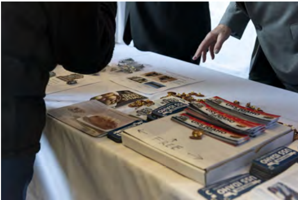
The USS IDAHO Commissioning Committee giveaways were popular.