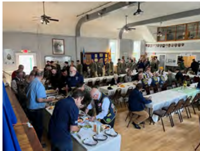
RIGHT—Event room at the USSVI Groton Subbase club.