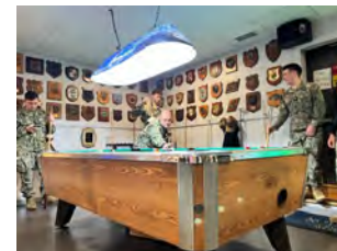
LEFT—Memorial pool room.