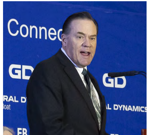
Governor Brad Little and U.S. Rep. Russ Fulcher watched as Terry Stackley Christened USS Idaho

Next will come the completion of her assembly and sea trials. Sea trials involve getting underway for a prolonged period during which her crew will check her out from “stem to stern”. They will ensure that every pump, compressor, generator, valve, gage, display monitor, alarm, and listening device is working. They will ensure that the reactor plant, steering and navigational mechanisms, communications equipment, weapons systems, stoves, refrigerators, freezers, and safety gear are all operational. In short, they will make sure that USS Idaho is ready to go to work.