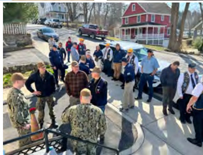
Telling sea stories with the crew, looking to the east up the hill.