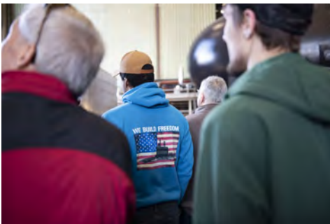
Electric Boat shipbuilders celebrates the christening.