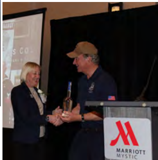
Governor Kempthorne presents a bottle of 44 North's USS IDAHO Huckleberry Flavored Vodka Batch 799 commemorating the christening of the USS IDAHO.