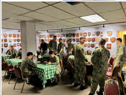
Bar and card room with plaques from every known submarine.