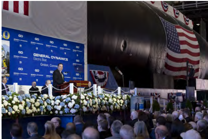
Idaho Rep. Russ Fulcher delivers remarks.