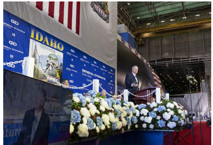
The future USS IDAHO.