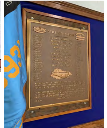
The "Still on Patrol" plaque for WWII lost submarines.