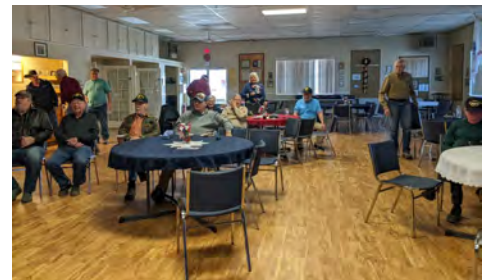
Friends gather at the American Legion Post 60 in Cascade, Idaho to watch the christening and drink SPUD Juice.