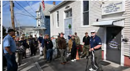
USSVI Groton Base building overlooking the Thames River.