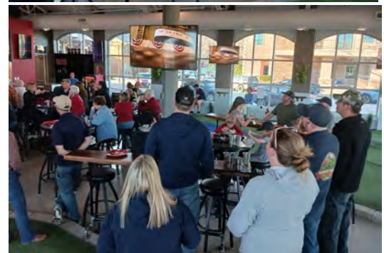
Boise watch party at Sockeye Brewing.