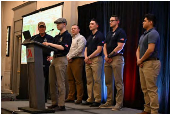
Crew members of PCU IDAHO share their experiences and impressions on past crew visits to Idaho.