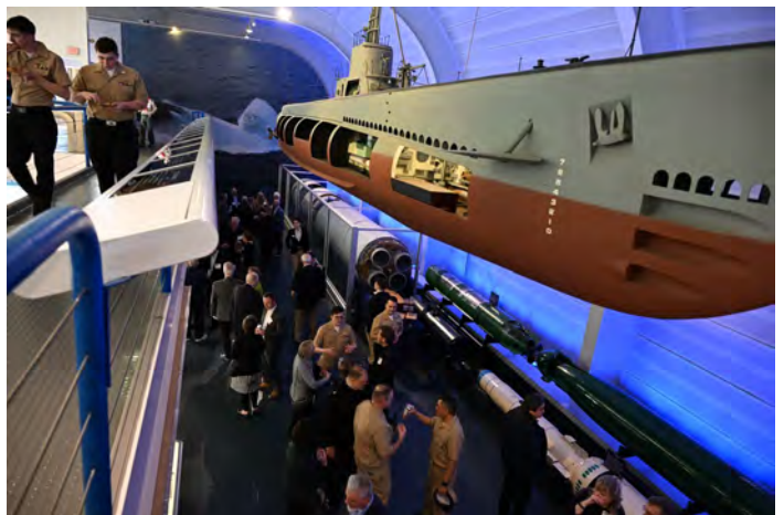
Guests enjoy the Subforce Museum and the suspended model of a WWII submarine.