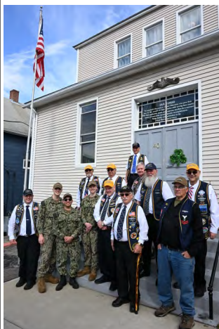
LEFT—the crew with our USSVI members from Idaho, Groton, and Pittsburg.