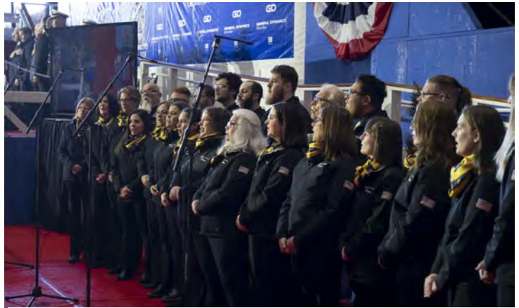
Idaho Governor Brad Little describes the submarine's role in defending American freedom.