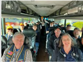
Touring the Groton Submarine Base.