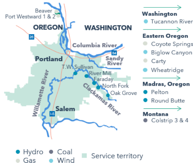
Figure 2: PGE's Service Territory

For more information, see PGE's website: www.portlandgeneral.com .