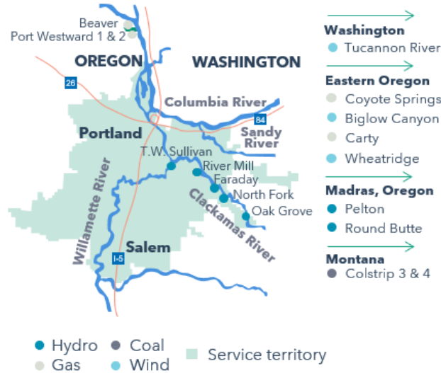
Figure 2: PGE's Service Territory

For more information, see PGE’s website: www.portlandgeneral.com .