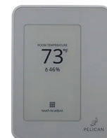
Touch Thermostat (TC Series)