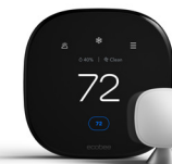
ecobee Smart Thermostat Premium