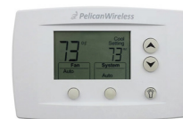
Traditional Thermostat (TS Series)