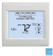
VisionPRO 8000 Smart Thermostat

honeywellhome.com/us/en/products/air/thermostats/