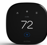
ecobee Smart Thermostat Enhanced