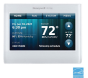
9000 Smart Thermostat TH9320WF5003