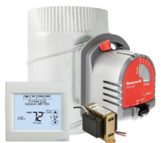
VisionPRO 8000 Smart Kit with Damper