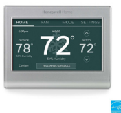
9000 Smart Thermostat RTH9585WF1004