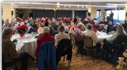
We all had a great time!