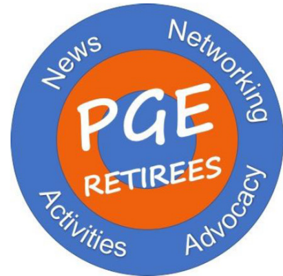
Figure 1, Temporary Logo