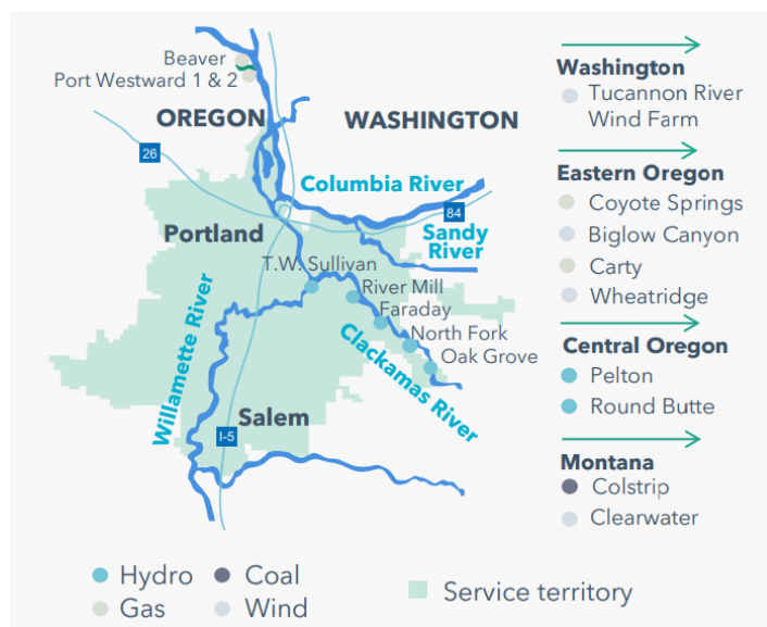
Figure 2: PGE's Service Territory

For more information, see PGE's website: www.portlandgeneral.com .