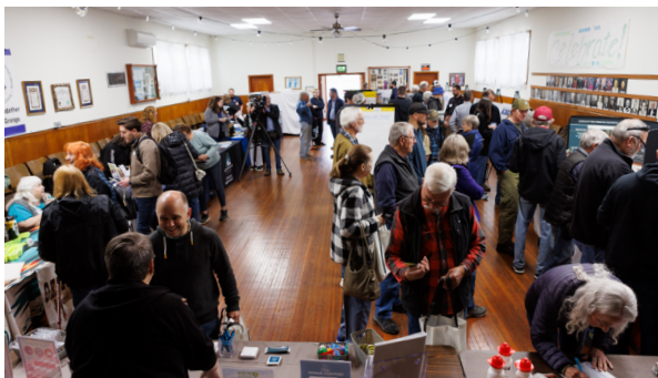
PGE and partners engage with the community at a Wildfire Ready Open House in Estacada, Ore., May 2025.