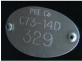
Oval Pole Tag

Every PGE pole contains a tag that looks like one of the pictures below. You must provide both the map (e.g. C73-14D in the top photo) and pole (e.g. 329 in the top photo) numbers.