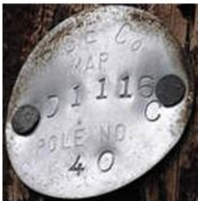
Round Pole Tag