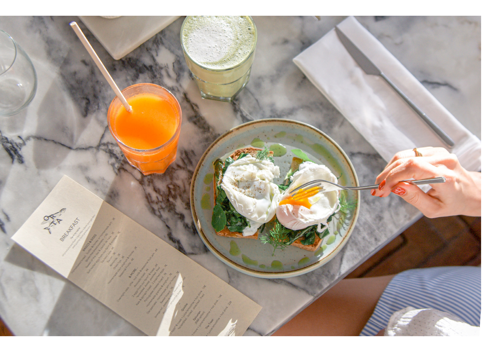
detox with our feel good cuisine