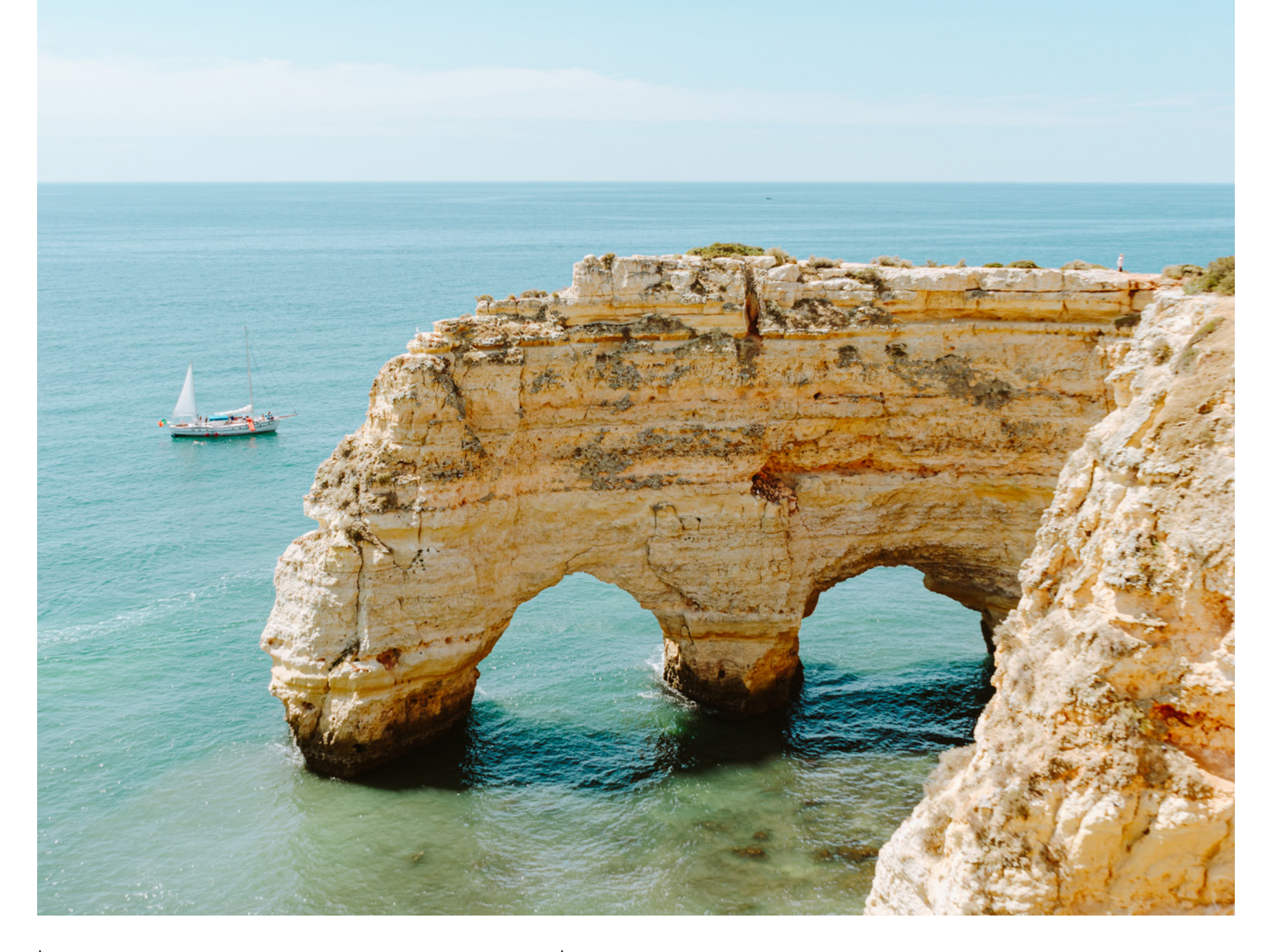
| follow the sun - explore the stunning coastline |