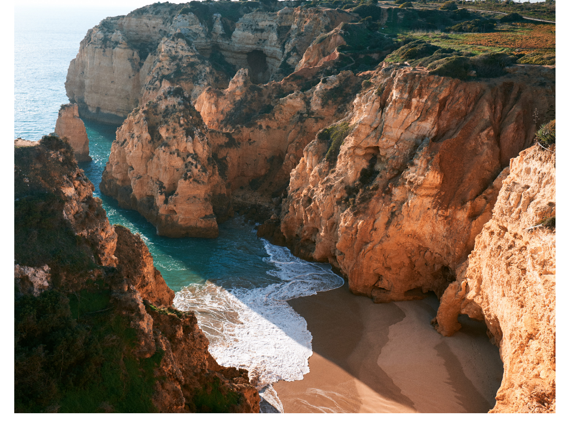
| guided meditative hike & picnic to reenergize by the sea |