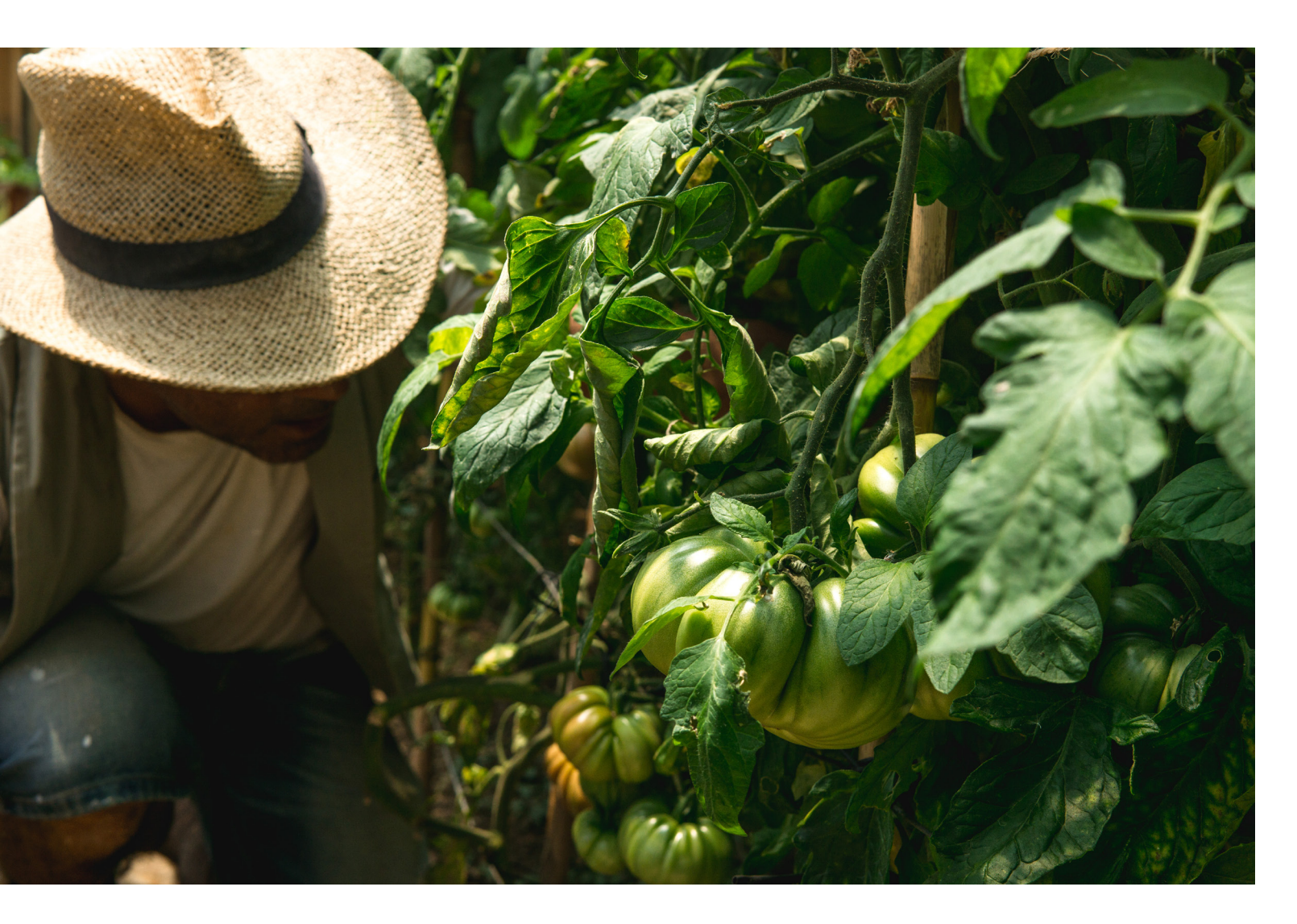
detox with our feel good cuisine