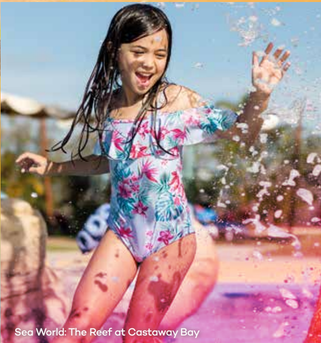
Sea World: The Reef at Castaway Bay