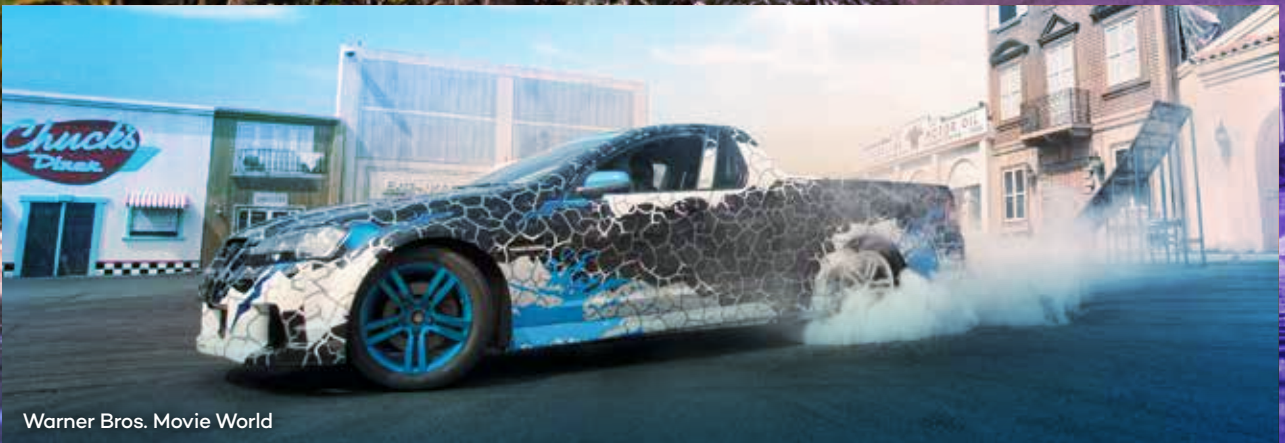
Warner Bros. Movie World