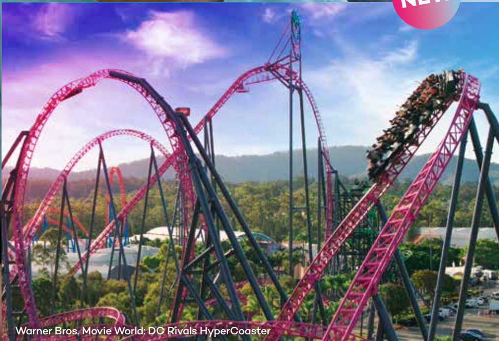
Warner Bros. Movie World: DC Rivals HyperCoaster