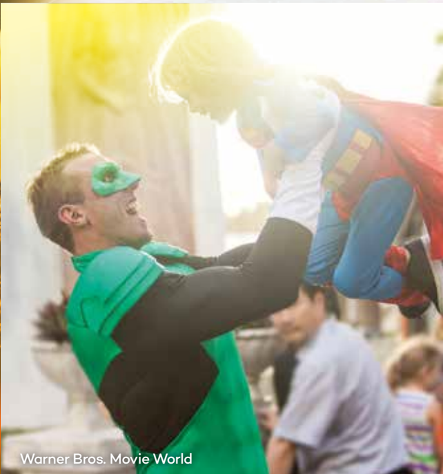
Warner Bros. Movie World