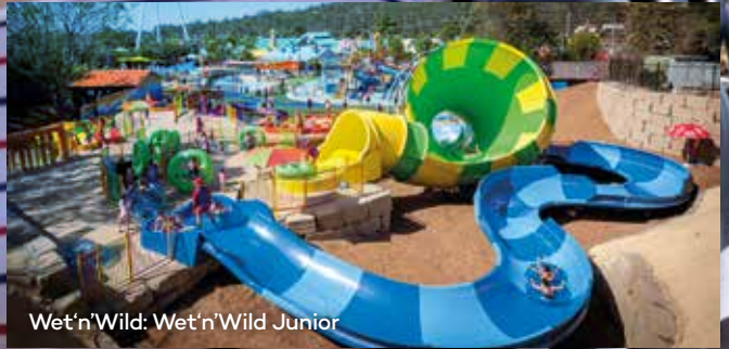
Wet'n'Wild: Wet'n'Wild Junior