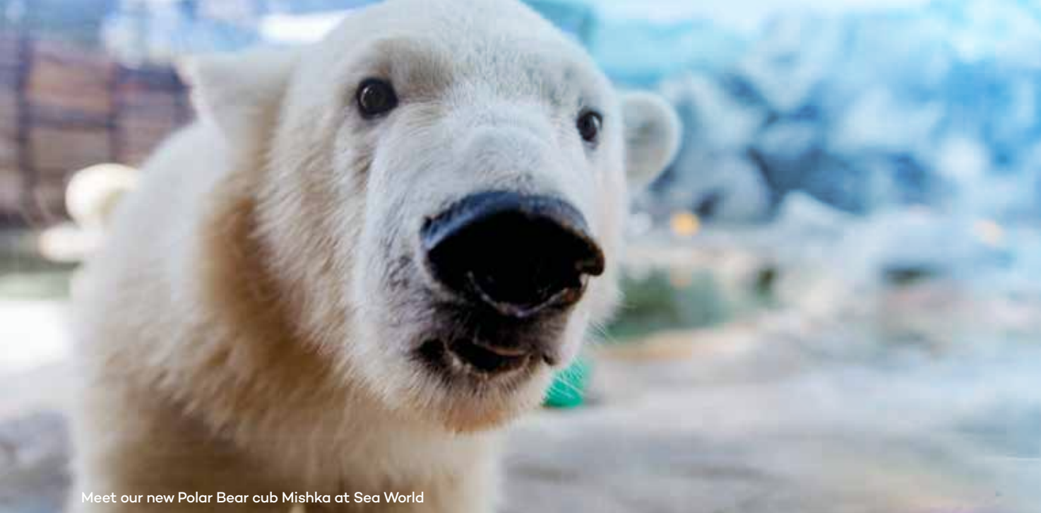
Meet our new Polar Bear cub Mishka at Sea World