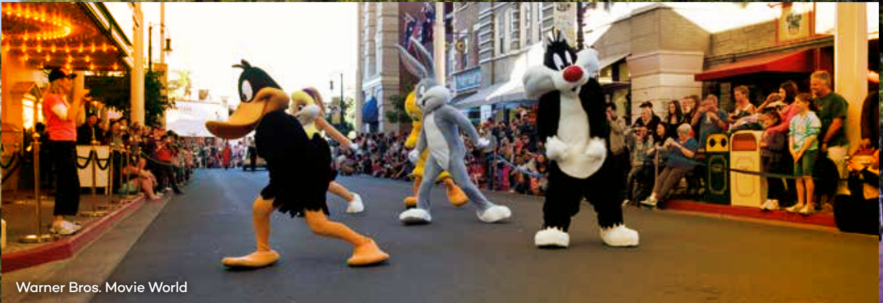
Warner Bros. Movie World