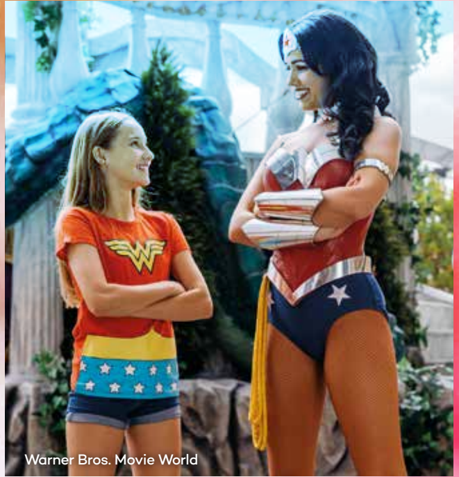
Warner Bros. Movie World