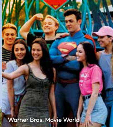
Warner Bros. Movie World