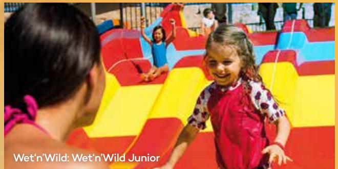
Wet'n'Wild: Wet'n'Wild Junior