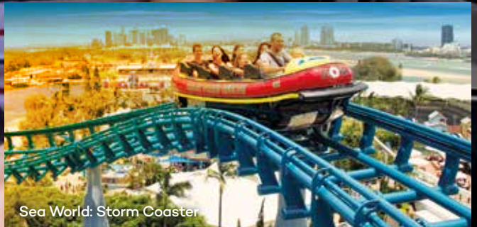
Sea World: Storm Coaster

How does it feel to ride one of the world's greatest rollercoasters? WOOPHORIC! At Village Roadshow Theme Parks there's enough fun, excitement and thrills for everyone, from the all new DC Rivals HyperCoaster to the fun-filled Nickelodeon Land for the little ones.