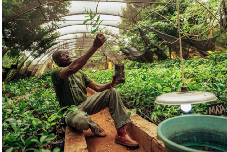
The Kasigau Corridor REDD+ project

In Kenya, we're supporting the Kasigau Corridor REDD+ Project, which protects over 500,000 acres of dryland forest and is home to more than 300 threatened or endangered species, including 11,000 elephants. The project provides economic alternatives to unsustainable activities such as poaching, slash-and-burn agriculture and illegal harvesting for charcoal, resulting in benefits for 120,000 community members.