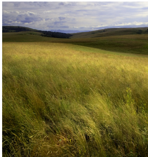
The Oregon Grasslands Project

Among the projects we're investing in is the Lightning Creek Ranch project in the State of Oregon, preventing the loss of North America's largest bunchgrass prairie. The investment would help landowners prevent farming that land and enhance natural carbon removal systems.