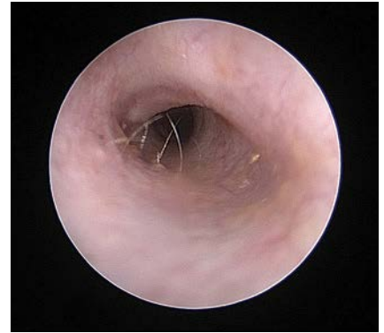
3 Eight weeks after initial presentation, the otitis externa had resolved and the tympanic membrane could be visualized.