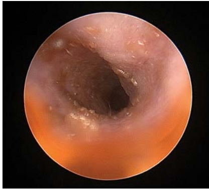
2 At the first recheck (2 weeks after initiation of treatment), the dog's ear was erythematous with mild hyperplasia and ceruminous exudates. The breed-related narrowness of the ear canal in addition to discomfort precluded a complete view of the tympanic membrane without anesthesia.