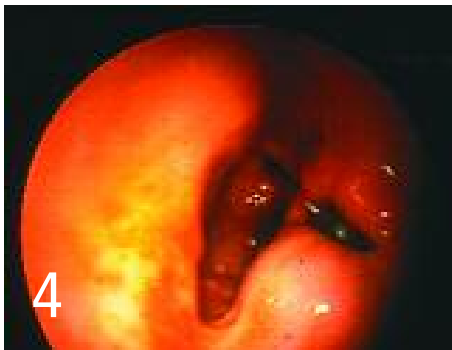
Gastric ulcer near the pylorus of a dog following administration of a nonselective NSAID (naproxen)

provide the antiinflammatory effects of NSAIDs without GI toxicity has led to the development of the selective COX-2 inhibitors. Many of the newer NSAIDs now used in dogs were also designed to be COX-2 selective. In humans and animals, these drugs have been shown to have reduced GI toxicity compared with nonselective NSAIDs. 12, 13 Furthermore, as previously discussed, COX-2 plays an important role in gastric cytoprotection and inhibition of this enzyme can lead to GI toxicity. A recent article by Lascelles documented GI perforation in dogs treated with a selective COX-2 inhibitor, although most of these dogs were treated at increased doses, for extended periods of time, in conjunction with other ulcerogenic drugs, or in the presence of other systemic diseases that may compromise gastric mucosal blood flow. 14