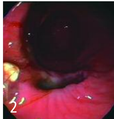
Gastric ulcer following administration of a COX-2 selective inhibitor in a dog

Omeprazole, a proton pump inhibitor (PPI), has shown success in preventing gastrointestinal ulceration associated with aspirin in dogs, but the results were not statistically significant due to the small number of dogs in the study. 10 PPIs are, however, the treatment of choice to prevent