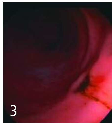
A second gastric ulcer following administration of a COX-2 selective inhibitor in the same dog as in Figure 2

NSAID gastropathy in human medicine. 1 For the most part, these therapies are more effective in the treatment of NSAID-induced gastropathy once the NSAID is discontinued than they are in prevention.