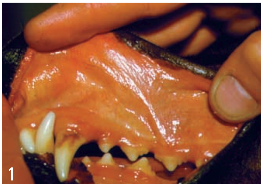
1 Icteric mucous membranes in a dog with severe immune-mediated hemolytic anemia