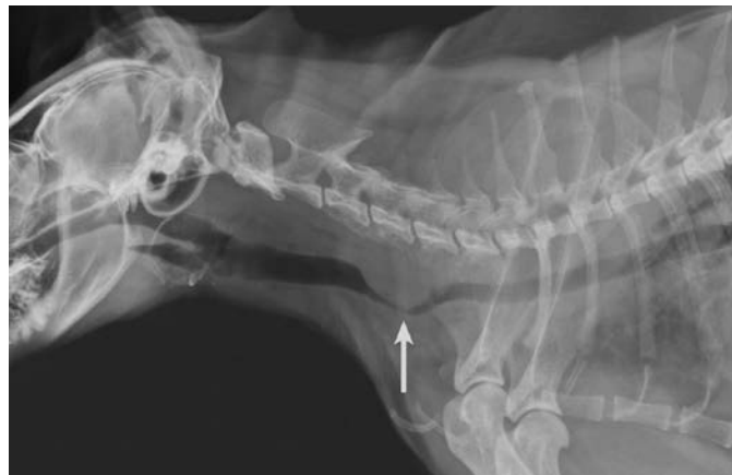
2 Cervical radiographs performed on the same cat as in Figure 1. A large cervical tracheal mass (arrow) occluding approximately 90% of the trachea at C3–C5 can be observed.