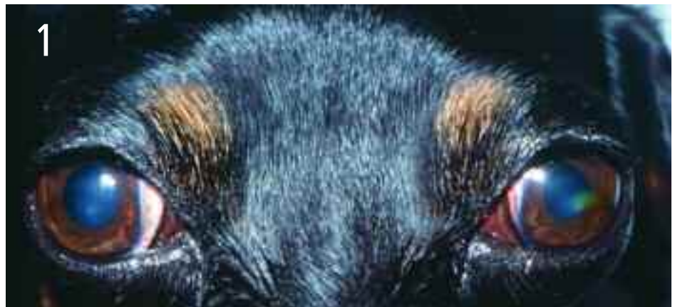
Bilateral extraocular photograph of the patient showing bilateral exophthalmos, slight exotropia (OD > OS), and bilateral elevation of the third eyelid. A focal, axial, superficial corneal erosion was also present in the left eye.

Lupus erythematosus and antinuclear antibody testing were negative. The patient's fresh frozen serum was incubated with normal canine extraocular muscle and staphylococcal protein A conjugated with horseradish peroxidase (SPA-HRPO), then stained for peroxidase localization. 1 No labeling of myofiber components was observed. Serology for type 2M myofibers was negative. 2,3 Thoracic radiographs demonstrated no evidence of neoplasia or fungal disease.