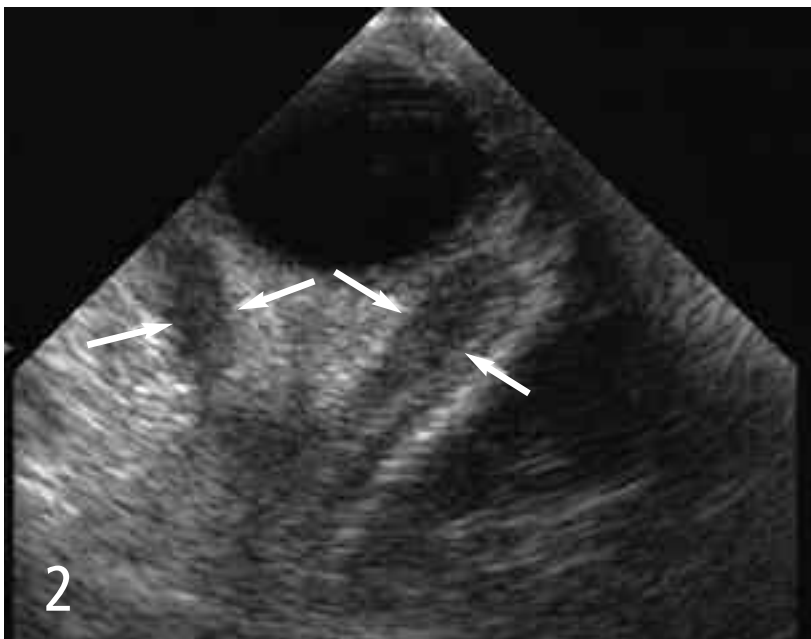
Ocular ultrasonography of the right eye. Note the markedly swollen extraocular muscles (arrows) with homogeneous low-reflective enlargement, diagnostic of myositis. The appearance of the left eye was similar.