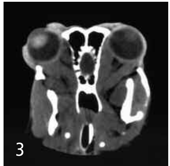
A 43° oblique dorsal plane CT image. This technique was used to optimize extraocular muscle imaging. Abnormalities were limited to bilateral extraocular muscle enlargement.