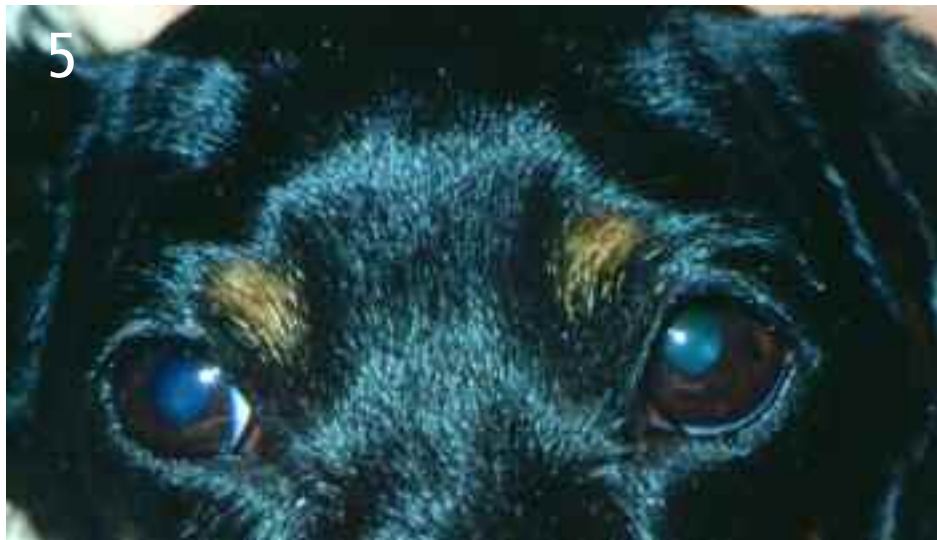
5 Bilateral extraocular photograph obtained at 6-month recheck. No evidence of exophthalmos or corneal ulceration was seen OU. The dog had excellent ocular motility.

Initial treatment consisted of prednisone (1 mg/kg PO Q 12 H), azathioprine (2 mg/kg PO Q 24 H), triple antibiotic ointment (OU Q 6 H), atropine (OS Q 24 H for 3 days), and an Elizabethan collar to prevent self-trauma. Prednisone and azathioprine were initiated concurrently due to histologic evidence of sclerosing inflammation. Immunoregulatory agents such as cyclophosphamide, azathioprine, methotrexate, and/or cyclosporine, in combination with corticosteroid therapy, may reduce the amount of fibrosis and cicatricial sequelae to this type of extraocular inflammation. 5