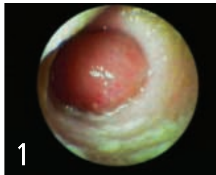
1 Inflammatory polyp in the horizontal ear canal of a cat

Age and Range. Otitis externa can occur in very young puppies and kittens due to ear mites. Puppies can also manifest adverse food reactions early in life, resulting in ear canal inflammation. Young adult cats with middle ear disease may present with nasopharyngeal polyps ( Figure 1 ). Middle-aged dogs with atopic dermatitis seem to represent the largest portion of dogs with otitis. Older dogs with otitis may have chronic ear problems.