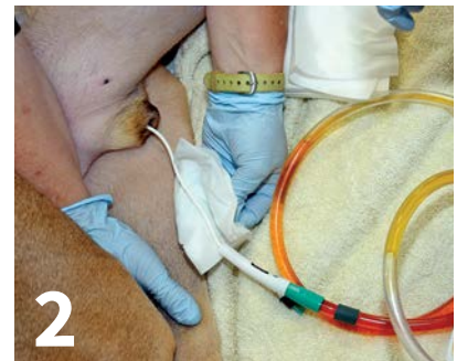
▲ The outside of the collection system should be visually evaluated and cleaned every 4 hours with a dilute chlorhexidine solution.