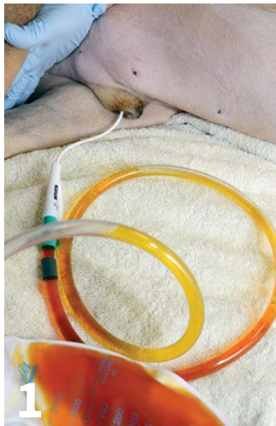
▲ A closed urinary collection system should be used to prevent external contamination.