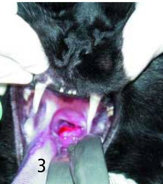
Large, red mass visible on the larynx

See Aids & Resources, back page, for references, contacts, and appendices.