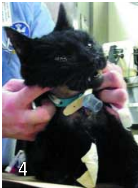
The patient recovering from anesthesia after biopsy of the laryngeal mass and placement of a temporary tracheostomy tube