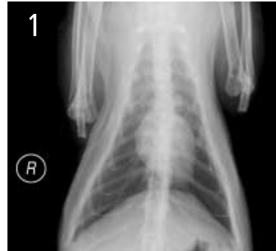
Lateral thoracic radiograph

Differential Diagnosis. Problems identified include respiratory distress characterized by increased effort and referred upper airway sounds, heart murmur, and anorexia. Differential diagnoses for respiratory distress include upper airway obstruction (including mass or laryngeal paralysis), pulmonary thromboembolism, hyperthyroidism, or other metabolic or systemic disturbances. This case is challenging due to the lack of radiographic abnormalities consistent with most common causes of feline respiratory distress.