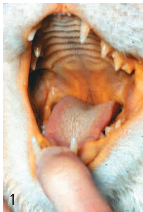
Drugs can lead to hepatotoxicity with jaundice, either due to massive hepatic necrosis or drug-induced cholestasis.

The liver is particularly susceptible to drug toxicity because it is the site of first-pass clearance of many orally administered drugs and of P450-mediated bioactivation of compounds to more