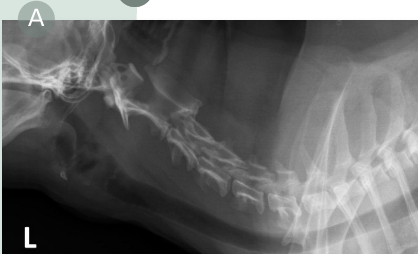
2 Cervical radiographs (A and B) demonstrating scoliosis.

SM is characterized by the development of fluid-filled cavities within the spinal cord parenchyma and can be caused by numerous congenital (Figure 3, white arrows) or acquired (eg, trauma, meningitis, neoplasia) mechanisms of disturbed CSF flow dynamics. 1,2,5