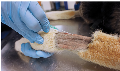
Figures 6 and 7. The catheter must be inserted at a 10°-30° angle to breach the skin.