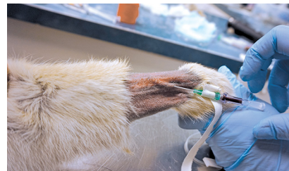
Figure 8. A flash of blood should be visualized in the catheter hub.