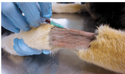
Figures 9 and 10. The catheter should be carefully leveled parallel to the vein and slowly advanced forward.