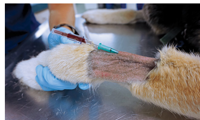
Figure 11. The catheter is pushed off the stylet and all the way into the vessel.

6 Grasp the hub of the catheter firmly with the dominant hand, using at least 2 fingers and taking care not to touch the catheter itself. With the other hand, firmly grasp the patient's leg below the area where the catheter will be placed to prevent leg movement during placement.