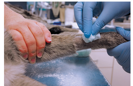
Figures 3 and 4. Prepare the site with an antibacterial solution on sterile gauze and a rubbing alcohol gauze.

3 Prepare the site in a manner similar to surgical preparation ( Figures 3 and 4 ). Place an antibacterial solution (2%-4% ChlorhexiDerm or povidone-iodine) on sterile gauze and alternate with a rubbing alcohol gauze. 1-3 The antibacterial solution should maintain contact with the skin for a full minute. 2 Avoid palpating the insertion site following the scrub. 1