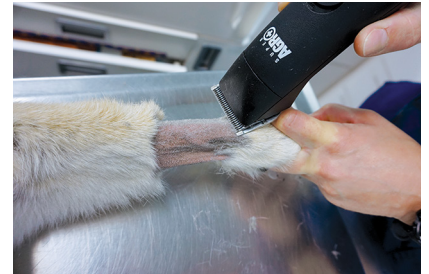
Figures 1 and 2. Shave the patient's hair to visualize the vein.

2 Nonsterile medical gloves should now be worn 1 ; wearing gloves before this step may result in the gloves touching the shaved hair.