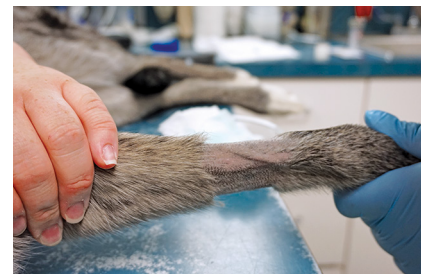
Figure 5. Restrain the patient while placing the catheter.

5 Before inserting the catheter, place any necessary restraint devices (eg, muzzle, towels, Elizabethan collar) on the patient. At this step, the team member placing the IV catheter and the team member restraining the patient have equally important responsibilities. One team member places the IV