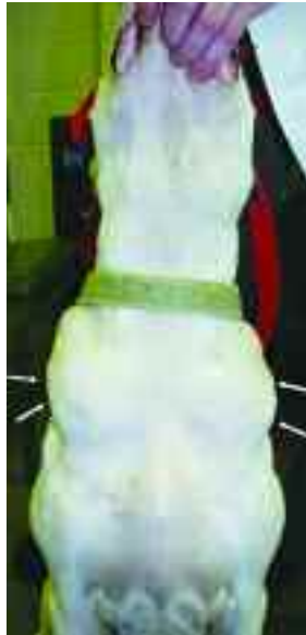
Massively enlarged prescapular lymph nodes in a dog with multicentric lymphoma. Multicentric lymphoma is a disease process that is most commonly associated with hypercalcemia of malignancy.