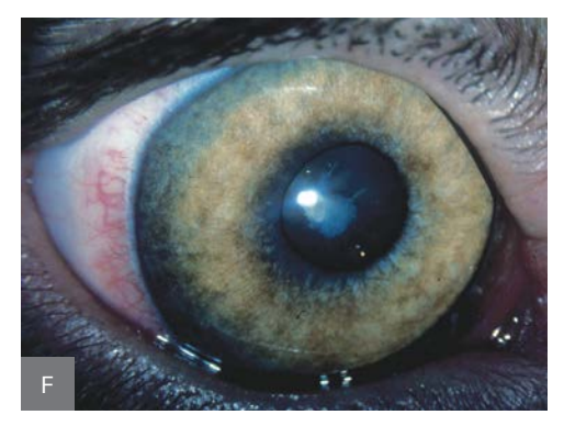
A nuclear cataract visible with direct illumination in the eye of a dog.