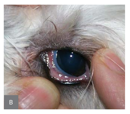
The outer surface of the third eyelid can be inspected by pressing on the globe (through the upper lid), thus causing protrusion of the third eyelid. The palpebral conjunctiva of the lower eyelid is also inspected at the same time by everting the lower eyelid.