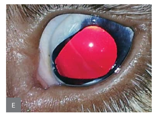
The pupil is abnormally shaped as a result of iris coloboma in the nasal half of the pupil (6 to 12 o'clock). The red reflection through the pupil indicates a subalbinotic fundus, which is a normal variation.