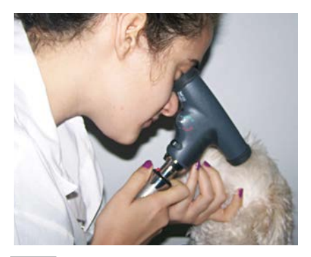
Monocular indirect ophthalmoscopy is used to examine the fundus.