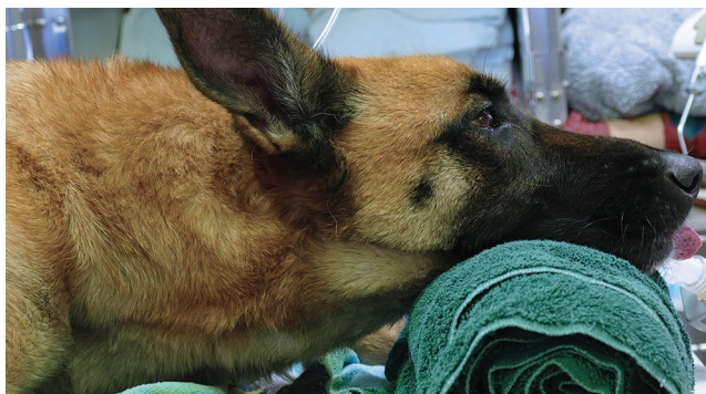
Figure 1. Proper patient positioning to image the maxilla

For example, image the caudal cheek teeth in the maxilla with the tube head at a 60° angle from the horizon. 2 When the patient is positioned with the