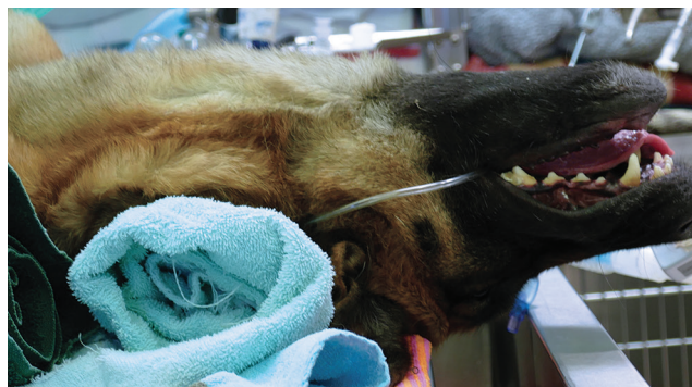
Figure 2. Proper patient positioning to image the mandible