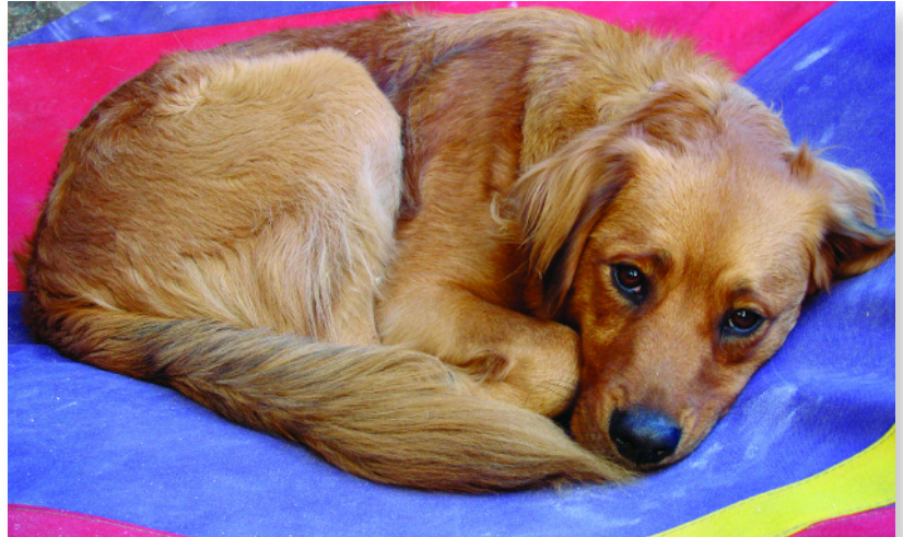
All photos of Beezus courtesy of Dr. Burkitt Creedon

To acquire the most accurate blood pressure values, cuff height should be as close to the level of the right atrium as possible ( Step 1A , page 28).