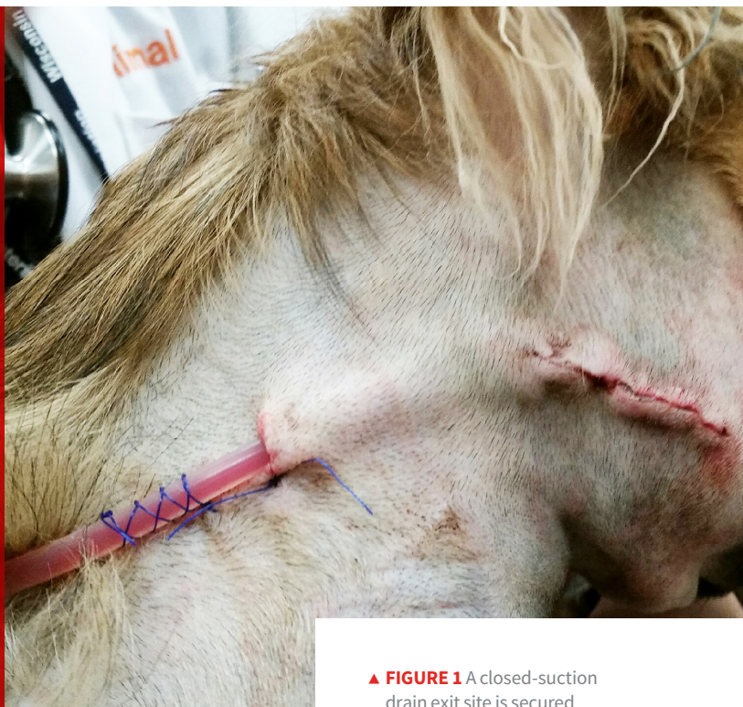
▲ FIGURE 1 A closed-suction drain exit site is secured with a mattress suture, and a finger-trap suture around the tubing prevents slipping.