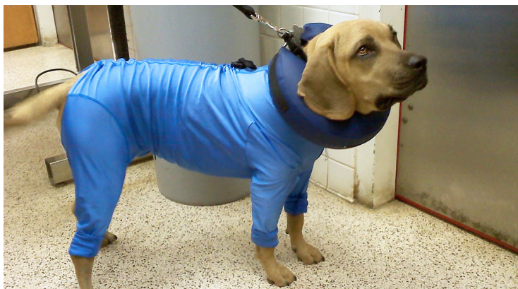
▲ FIGURE 7 A body suit and an inflatable neck collar protect the patient from chewing its bandage or drain.

hypochlorous acid). Hypochlorous acid wound irrigation solutions have been reported to disrupt biofilms and are effective against drug-resistant bacteria. 2 After the area is cleaned, it should be bandaged as previously described.