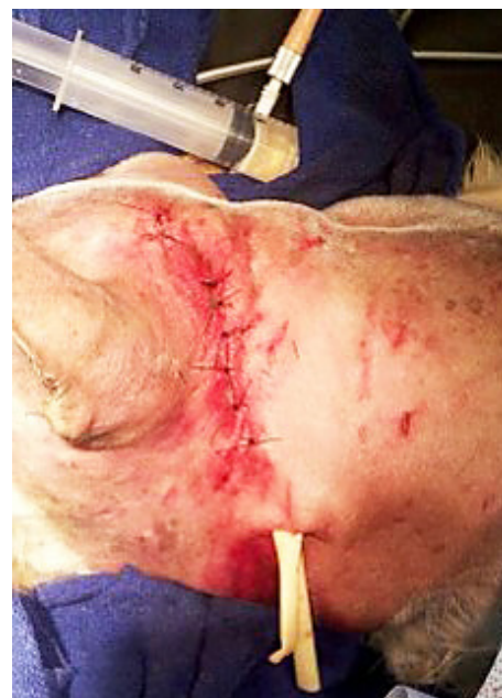
▲ FIGURE 3 Penrose drain exiting ventrally on the neck of a dog

Low-cost commercial options with similar absorbent functions may include baby or adult diapers, incontinence pads, and feminine hygiene pads. These