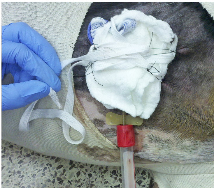
▲ FIGURE 6 Tie-over bandage used to secure a closed suction drain placed in a wound on the ventral thorax

adherence of subsequent drapes. The absorptive layer should be removed and evaluated for drainage quantity and character before disposal in an appropriate trash receptacle. Gloves should be changed and the site around the drain cleaned with an antiseptic solution (eg, 0.05% chlorhexidine or 0.01%