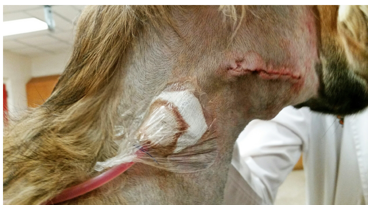
▲ FIGURE 5 Strike-through of the absorbent gauze is easily seen through the transparent film dressing.

ination gloves can be used, but proper hand hygiene is critical. Hands should be washed with soap and water for 20 to 60 seconds or thoroughly coated with an alcohol-based hand sanitizer (>60% alcohol). Hand sanitizers will only suffice if there is no organic debris (eg, dirt, urine, feces, blood) on the hands.