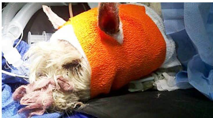
▲ FIGURE 4 A soft padded bandage placed over the exit site of the Penrose drain shown in Figure 3 .

For passive drains, bandages are changed before or when strike-through occurs. For patients with resistant infections, bandage changes should occur daily—at the end of the day when possible so that the room can be properly cleaned and sanitized before its next use. Sedation and analgesics may be required for bandage changes, and aseptic technique should always be followed. A clean laboratory coat or gown should be worn and changed after the bandage change is complete. This helps prevent the spread of resistant bacteria. If sterile surgical gloves are not available, exam-