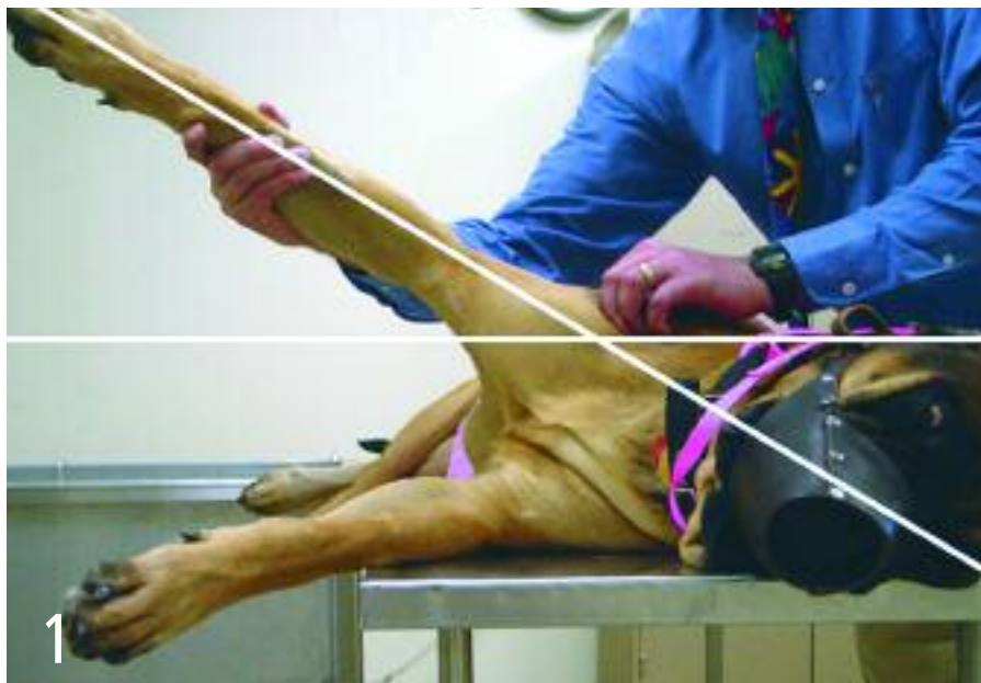
Shoulder abduction test. White lines represent the angles of humerus and scapula as they intersect during maximal abduction. Clinically, this angle should be measured with a goniometer and compared with the opposite side for reference.