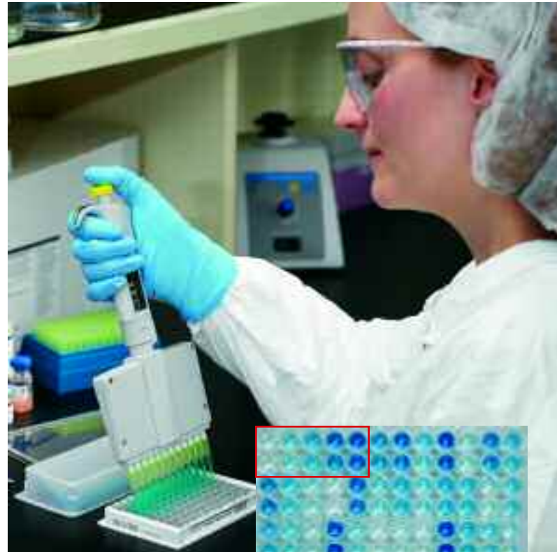
Spec cPL plate being prepared in a reference laboratory. The inset is an ELISA plate of the Spec cPL. There is a set of standards in the first two rows (wells 1 through 5), and the rest of the wells are loaded with clinical samples. Some samples clearly show intense color, indicating that serum concentration of pancreatic lipase is high and that pancreatitis is likely in that particular patient.

Acinar cells of the exocrine pancreas synthesize both digestive enzymes and zymogens (ie, inactive preforms) of digestive enzymes. One of the digestive enzymes being synthesized by acinar cells is classic pancreatic lipase, also simply known as pancreatic lipase. However, pancreatic acinar cells are not the only cells able to synthesize lipase, and many different lipases (ie, enzymes that digest lipids) are synthesized by different cell types in the body. All of these lipases have the same function (ie, proteolysis of lipids) and can thus potentially be detected by assays used to measure serum lipase activity. However, the different lipases secreted by the different cell types have a very different molecular structure and are thus detected by specific antibodies.