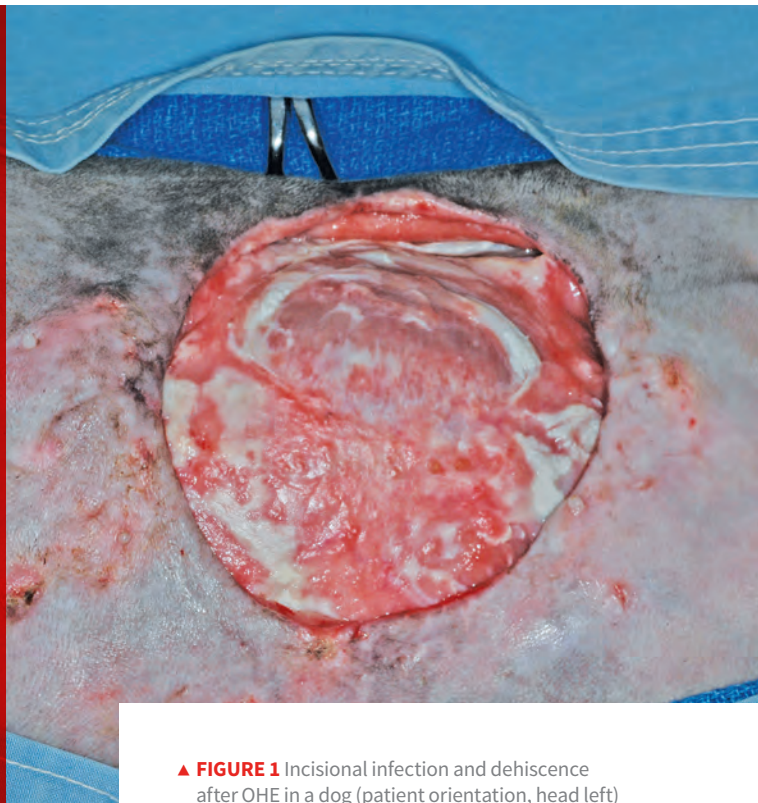
▲ FIGURE 1 Incisional infection and dehiscence after OHE in a dog (patient orientation, head left)