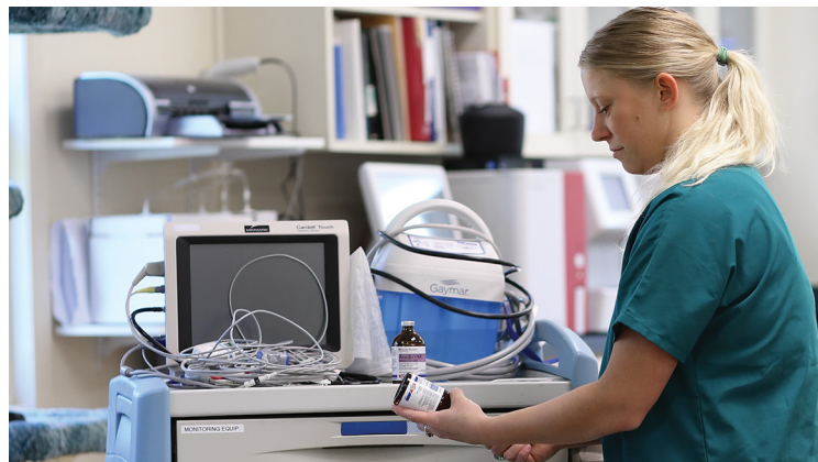
▲ FIGURE 2 Veterinary technicians provide expertise in many aspects of nursing care, and initial surveys indicate support for the term veterinary nurse .

Ultimately, the profession’s fate lies with its members. Efforts to establish higher standards in credential requirements, gain professional and public recognition, and protect a unified title will be stifled until the profession moves