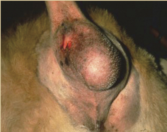
A bulge becomes visible lateral to the tail base as the bladder becomes distended.

Perineal hernias result from progressive weakness and ultimate unilateral or bilateral failure of the pelvic diaphragm (ie, levator ani and coccygeal muscles). These hernias can cause defecation strain when fecal matter accumulates in the rectal portion and is displaced through the pelvic diaphragmatic defect. A bulge becomes visible lateral to the tail base.