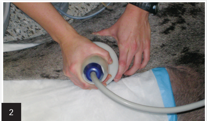
ESWT on a 5-year-old spayed Great Dane with arthritic stifle joint

Several studies have demonstrated positive results in joint range of motion and peak vertical force—as measured using force plate analysis—in dogs with stifle (Figure 2), hip, and elbow arthritis. For example, in dogs with unilateral elbow OA treated with ESWT, improvement in lameness and peak vertical force was equivalent to that expected with NSAIDs. 11