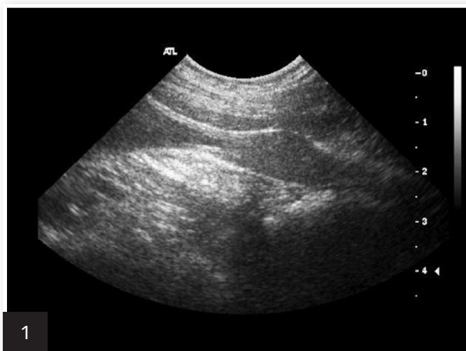
Sagittal image of a normal prostate in a castrated dog