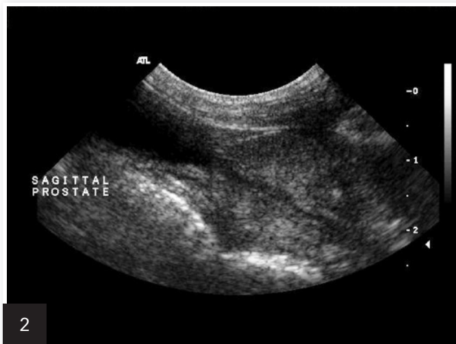
Sagittal image of a normal prostate in an intact dog; note the increased echogenicity of the prostatic parenchyma.