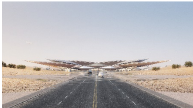
The international airport at AMAALA

The airport takes inspiration from its dramatic desert environment and will accommodate one million travellers per year on completion