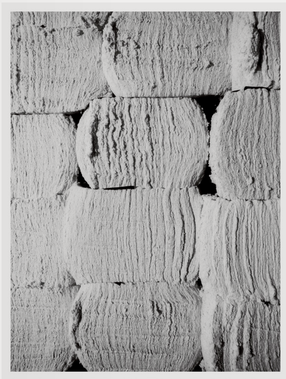
Photography by Umit Savaci, 2022

Materials alone don't make a product sustainable, but they do make up a large portion of a product's environmental impact – water use and pollution, greenhouse gas emissions and textile waste are all affected by textile choice. We use the highest quality, natural and renewable fibres available to ensure the longevity of our products, while taking into consideration their environmental and social impact when sourcing.