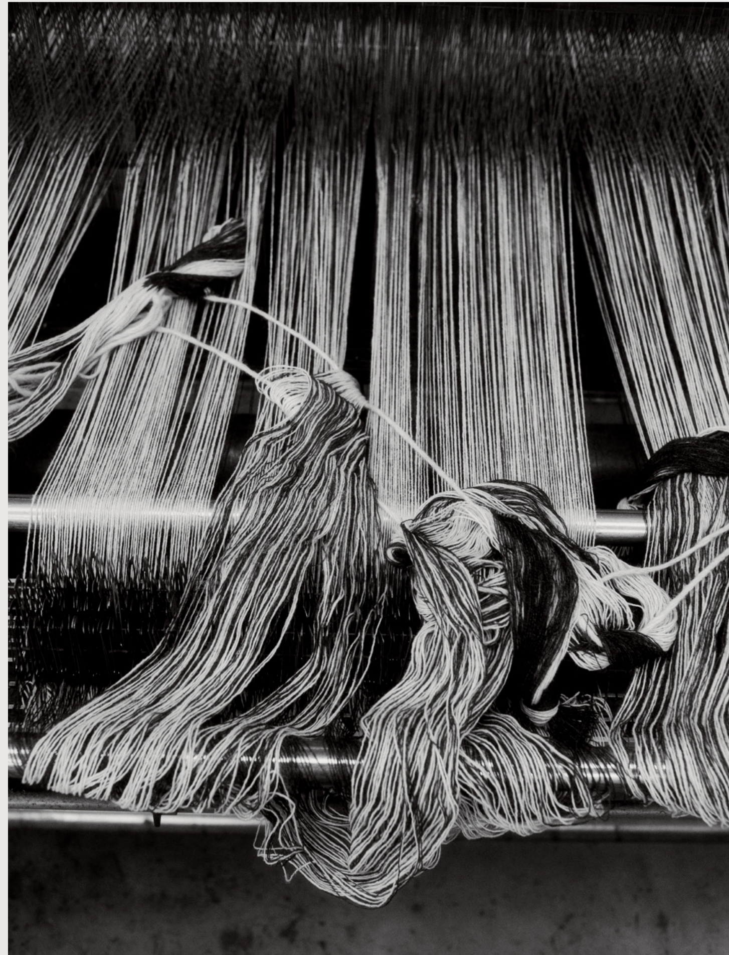
Photography by Umit Savaci, 2022

We're committed to the action we must take now to safeguard the future, not just because we need to, but because we believe in using business to drive positive change for everyone.