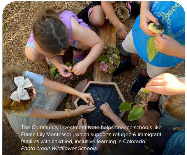
The Community Investment Note helps finance schools like Flame Lily Montessori, which supports refugee & immigrant families with child-led, inclusive learning in Colorado.

For more information on the Community Investment Note, please visit calvertimpact.org/cin